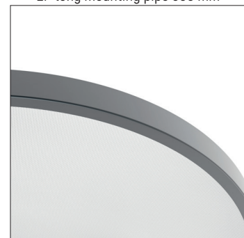
MP19H microprismatic diffuser